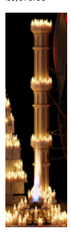
5. 2x Small Pillar - DIMENSIONS; 2800 x 490MM . Made using polystyrene and a polyurethane coating. Model made in three sections which attach together using box section. Bottom section to have ballast sunk in. Candles sunk into the model and attached with velcro. Design signed off with client. £4,630.41

4. 2x Large Pillars - DIMENSIONS; 4000MM x 700mm. Made using polystyrene and a polyurethane coating. Model made in three sections which attach together using box section. Bottom section to have ballast sunk in. Candles sunk into the model and attached with velcro. Design signed off with client. £5,679.55