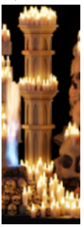
6. 8x Small Floor Skulls - DIMENSIONS; 1mx1m. Made from polystyrene with a polyurethane coating. Bottom will be flat, small weight to be sunk into the model. Candles sunk into the model and attached with velcro. Design signed off with client. Total price £9739.39